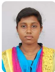
Prabagowre D (9.23 GPA)