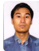
Kechongol (8.28 GPA)