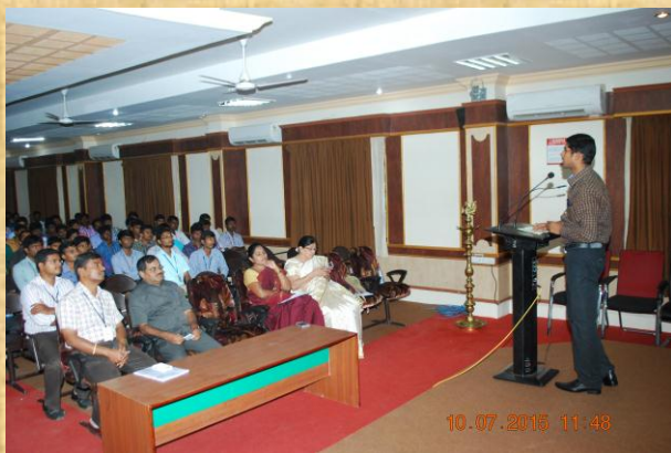
Guest Lecture on Job and Career Openings in Abroad