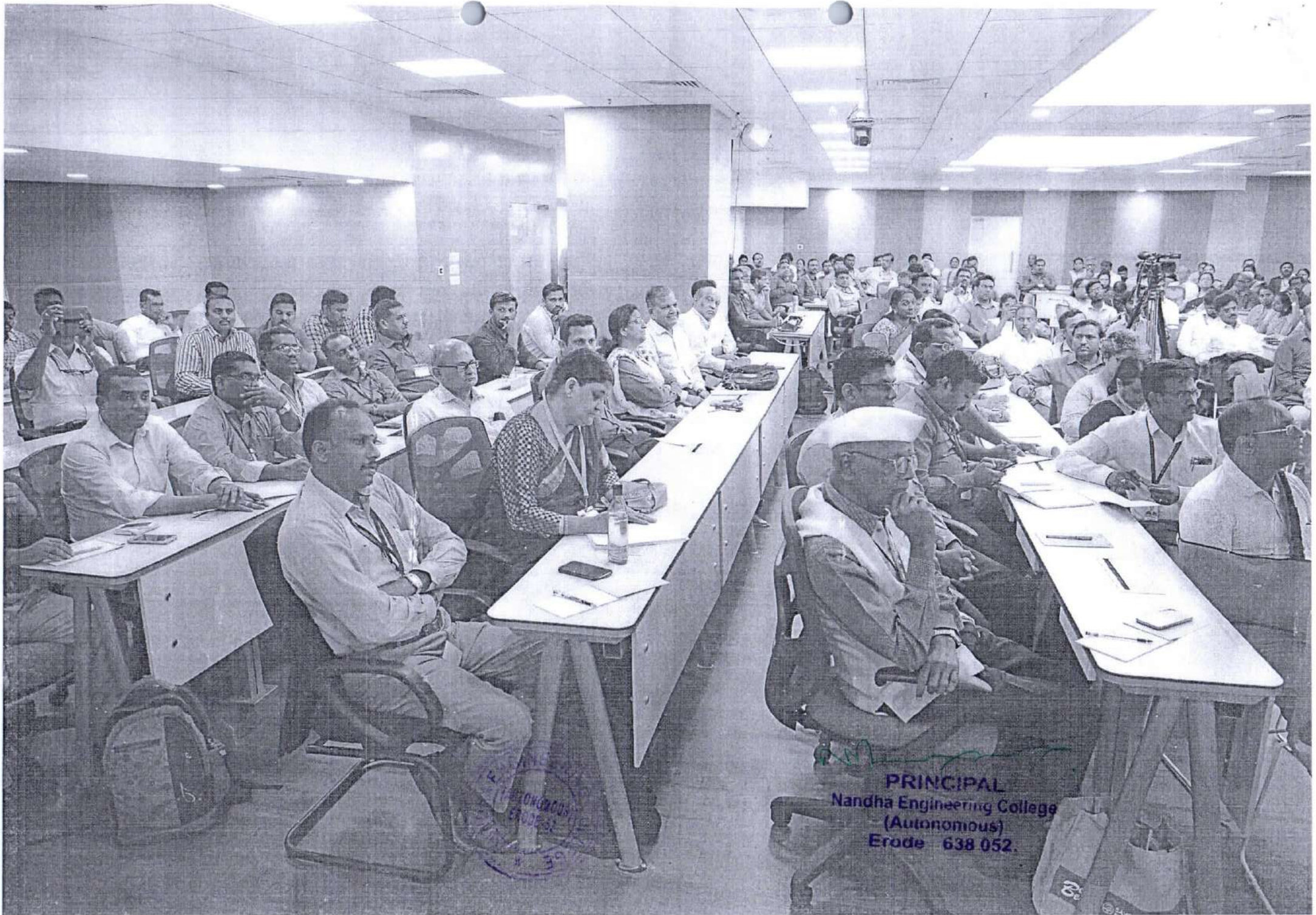
PRINCIPAL Nandha Engineering College (Autonomous) Erode 638 052.