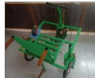
3-Wheels Electric Cycle