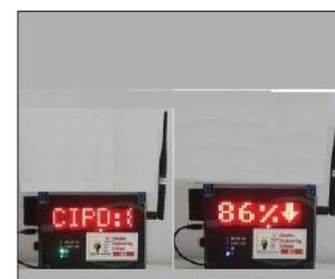
Water Level Indicator