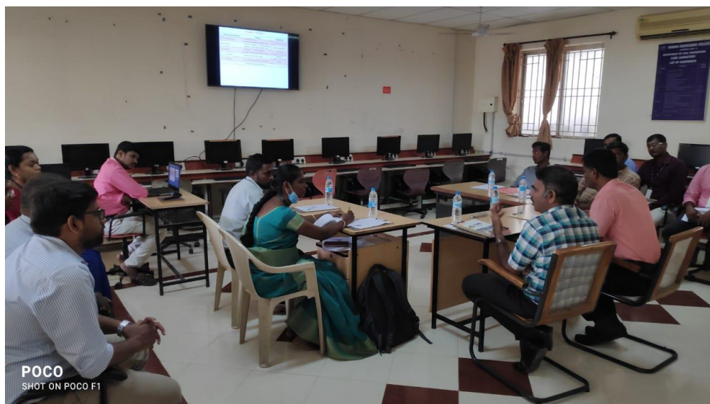
10 th Board of Studies Meeting held on 06 th August 2022