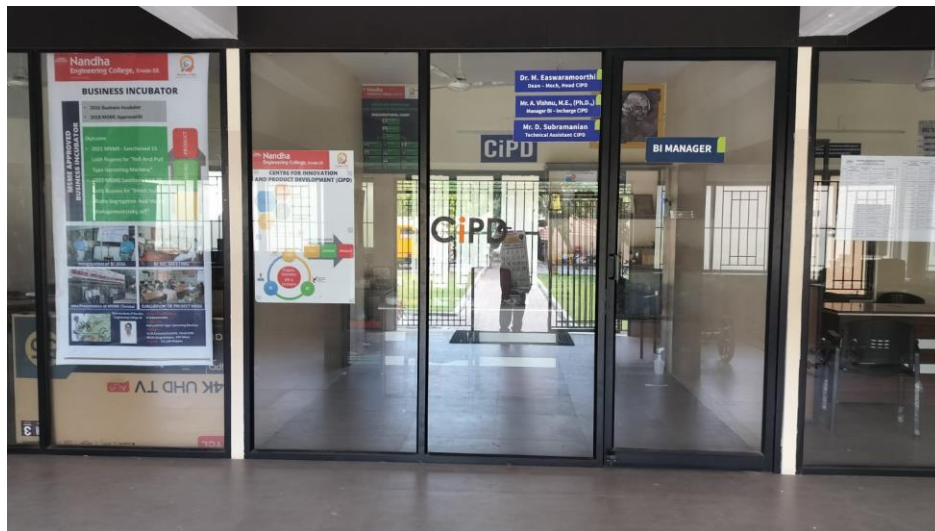
Manager BI Room

Business Incubator @ Nandha Engineering College was established in the year 2016 and received Host Institution (HI) status from MSME, Government of India in the year 2018. So far, 10 products have been launched; benefitting various sectors of society. The MSME under “Support for Entrepreneurial and Managerial Development of SMEs through Incubators scheme” had sanctioned Rs.15 lakhs in the year 2021, 14.75 lakhs in the year 2022, 29 lakhs in year 2023 and 59 lakhs in year 2024 to Nandha BI, and supported innovators to convert their ideas into prototypes / products.