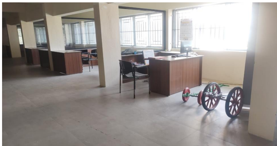
Individual Incubation Space