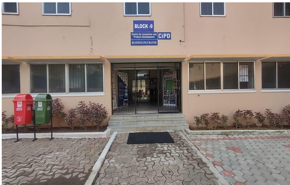
Centre for Innovation and Product Development (CiPD)

CiPD was established in Nandha Engineering College in the year 2014 with the aim of creating spark of innovation in the students' mind and to expose them to the existing problems that need to be solved. It encourages the students to come up with ideas which have innovation, Intellectual Property Right (IPR) component and potential commercial value. It connects the students with experts for mentoring. Project making, project exhibition& presentation, hackathon and participation in competitions are part of our yearly event (Innovation Day) schedule. The CiPD plays a vital role in inviting innovators, researchers, successful startups/entrepreneurs from varied fields to share their experience for problem solving and success scenarios which may benefit students/faculty members of the Institution. Further, the centre aims to build an interdisciplinary networks and teams for students and facilitate understanding of subtle aspects of innovation, IPR, startups and entrepreneurship.