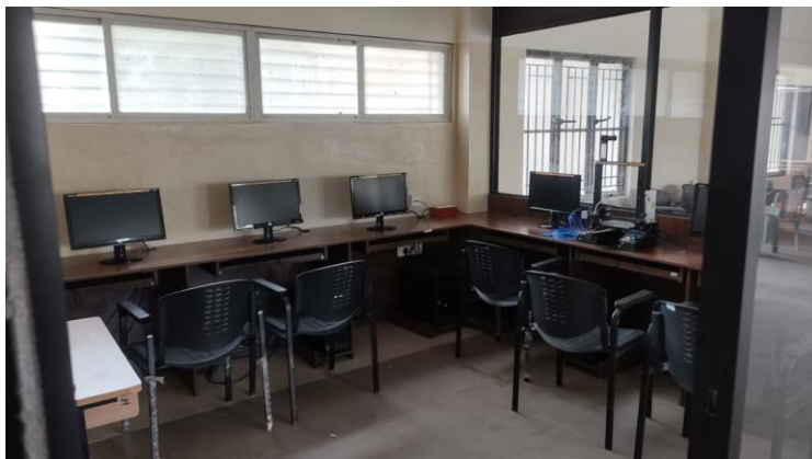
Systems & 3D Printer Room