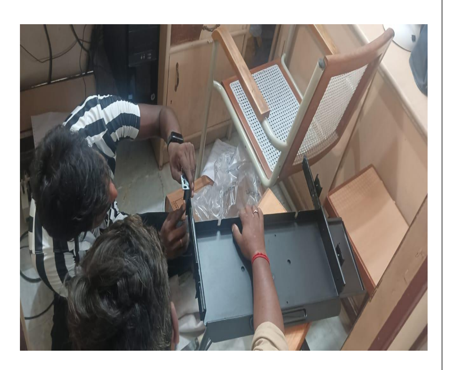
Table Repair Work

Website: www.nandhaengg.org Phone: 04294 - 225585, 226393